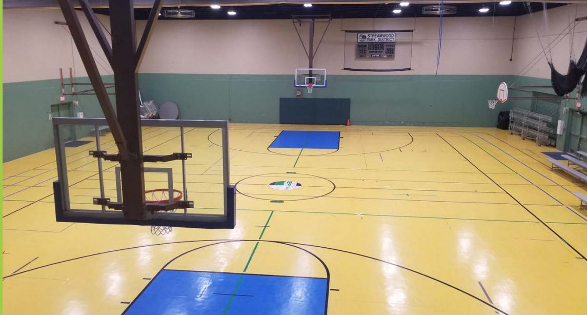
Current Gym Floor