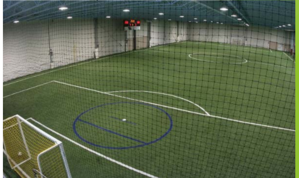
Proposed Artificial Turf